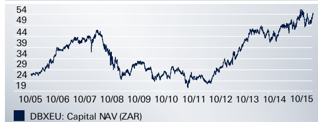
Description: This graph shows the change in unit value of the portfolio since inception using the NAV before any distributable income or management fees.

(The figures used are actual figures for the portfolio and not for individuals)